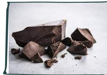
High Cacao Chocolate