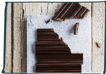
No/Low/Reduced Sugar Chocolate