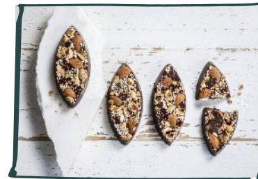
Organic / Sustainably Sourced