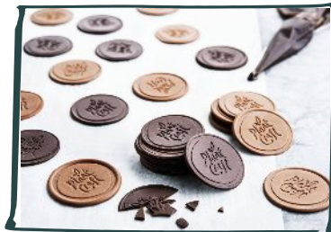
Plant Based / Vegan / Dairy Free Chocolate