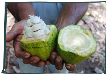
Cacaofruit Experiences / Wholefruit Chocolate